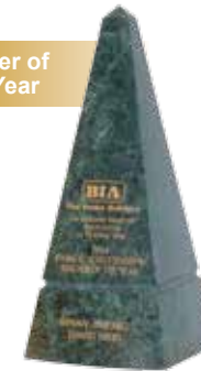
2004 & 2015 Award Winners